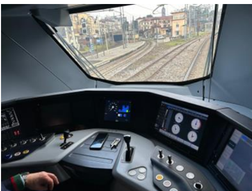
This was the view from the train driver's seat.

I met this lovely young man who ended up being a train driver, who as expected knew exactly what to do. Long story short, he got me to ride up front where the driver sits, with him and two other colleagues where one of his colleagues did the driving. I will never forget his kindness.