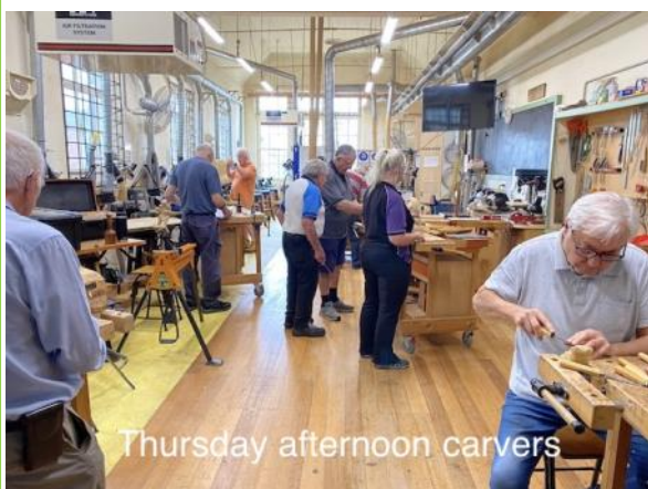
Thursday afternoon carvers