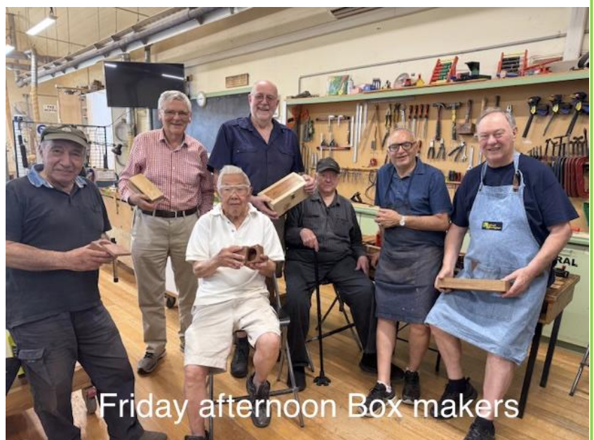
Friday afternoon Box makers