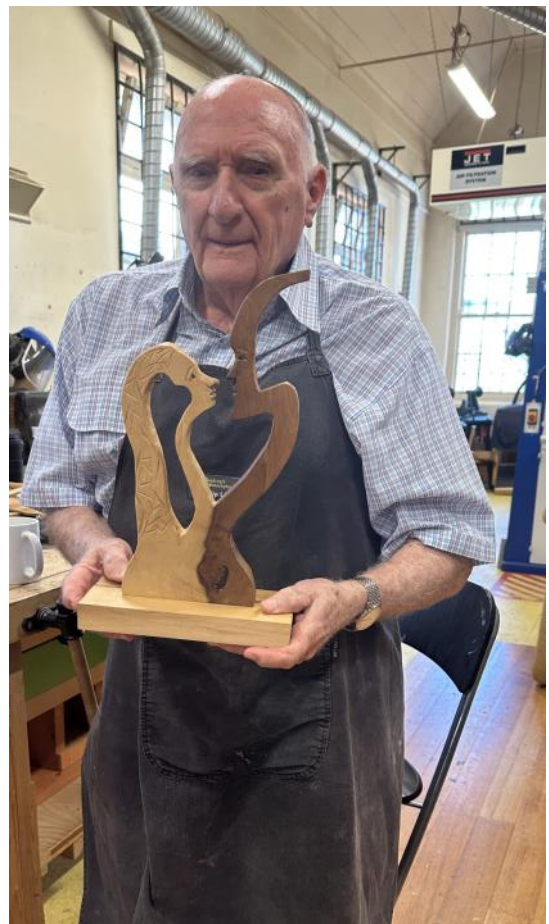
Philip Lind's abstract carving from a single piece of black heart sassafras