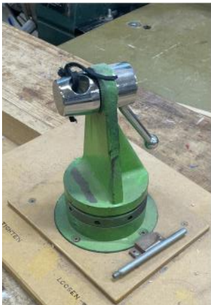
What we have

Has anyone seen the stem and plate for this light green Carver's Vice? The base is at the club but the rest of it has been missing for some time and a replacement can only be sought from England if at all. If you know its whereabouts please return it to its base.