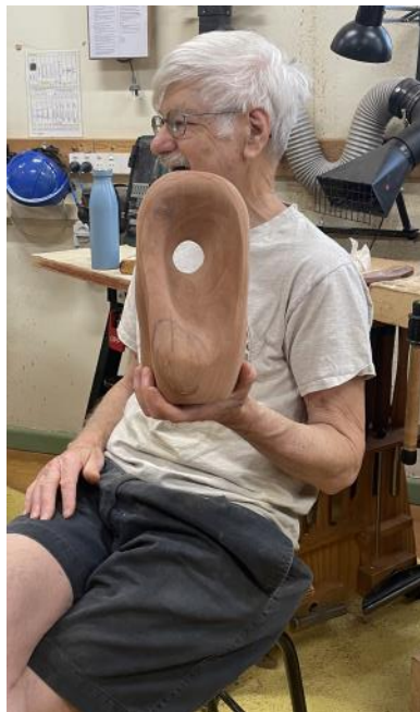
Above: Hank's redgum sculpture in progress