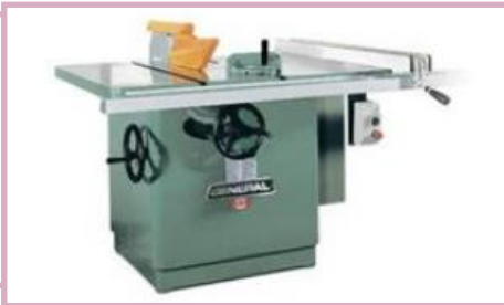
TABLE SAW: A large stationary power tool commonly used to launch wood projectiles for testing wall integrity. Very effective for digit removal !!