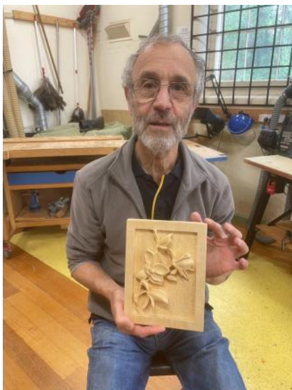
Left: Mel's magnolias