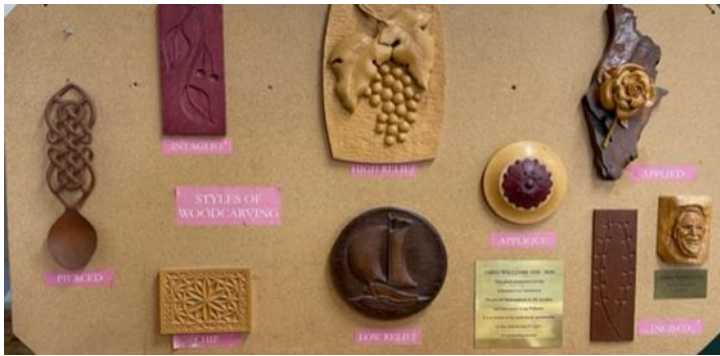
Title: Styles of Wood Carvings