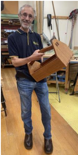
Left: Mel's Toolbox