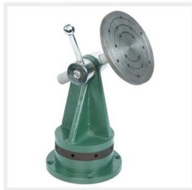
What we should have