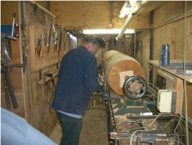
A view from the tail stock end of the 8ft log