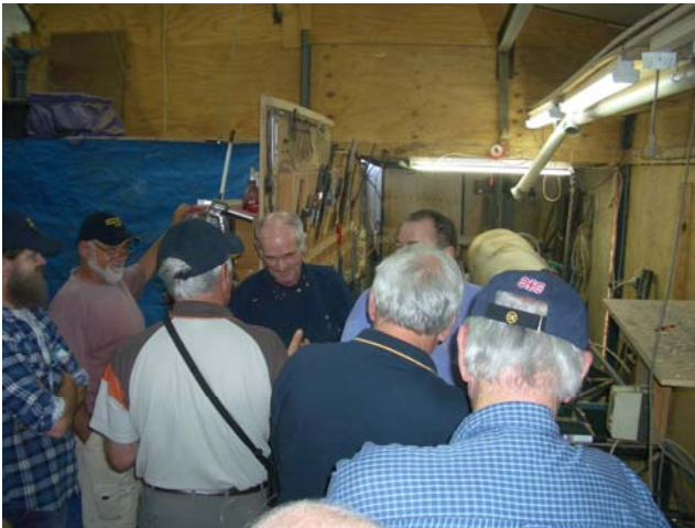
A view of the crowd sharing a joke