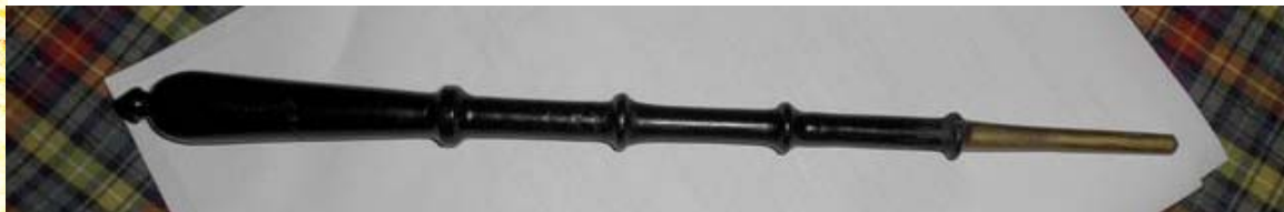
A COUPLE OF ITEMS FROM SHOW N' TELL FROM THE NIGHT