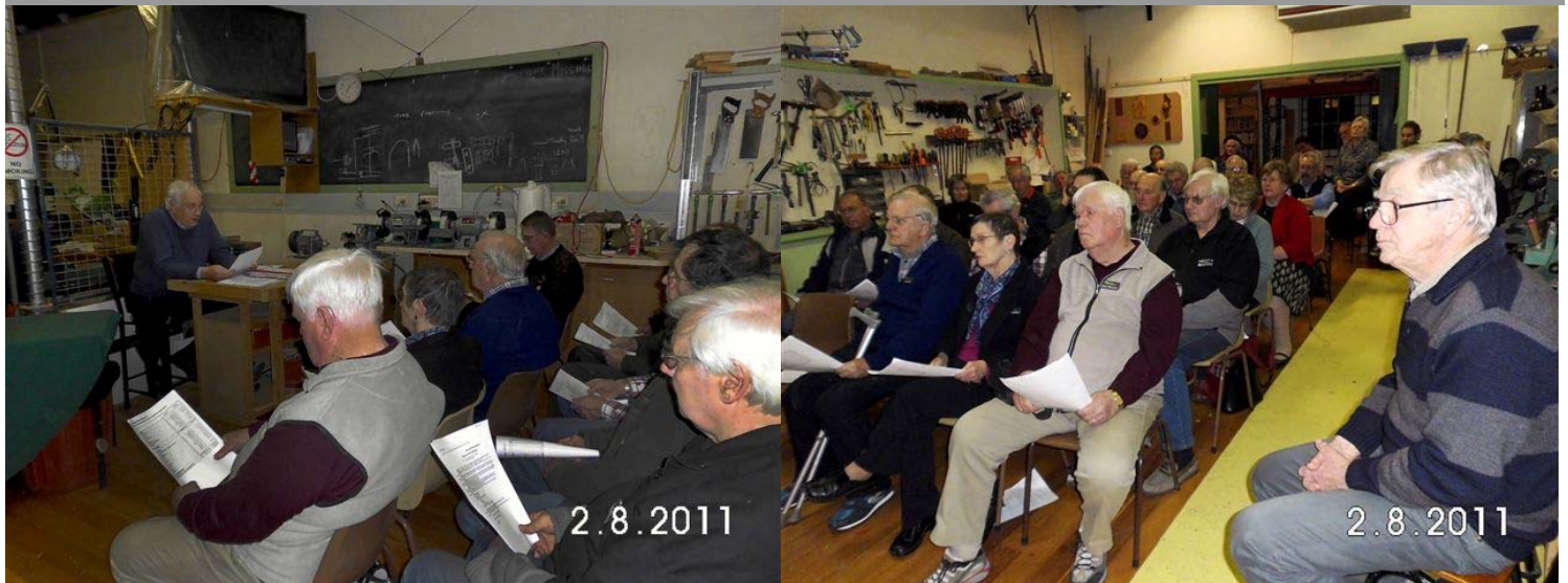
ABOVE SOME PHOTO'S FROM THE ANNUAL GENERAL MEETING