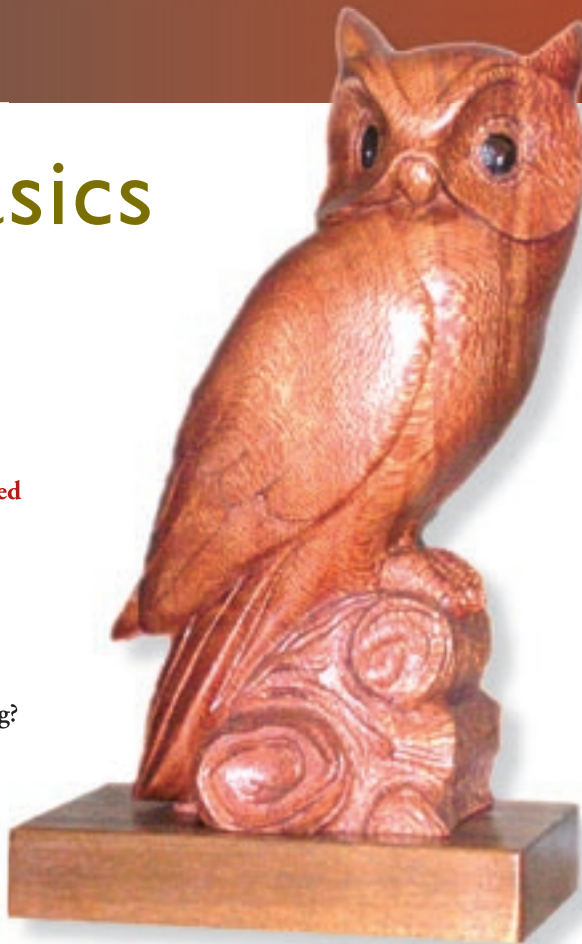
Ken Reid's very fine owl

When the English carver Ian Norbury produces a carving with a tooled finish