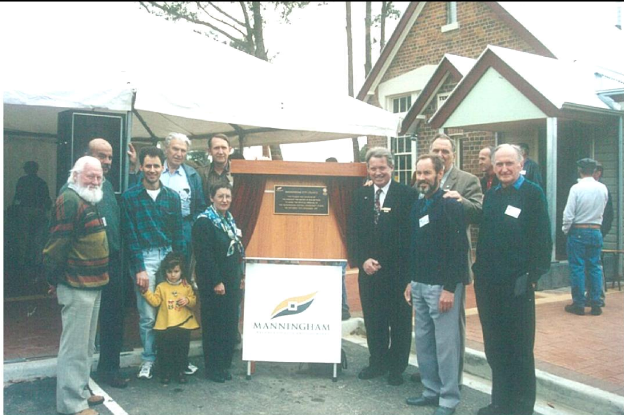
People in above photo from right to left.