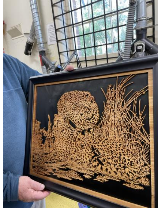
Bob's intricate scrollwork image