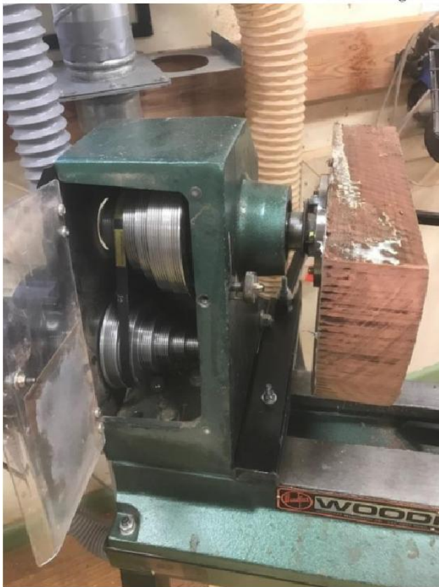
Photo on right shows blank still in lathe with missing section.