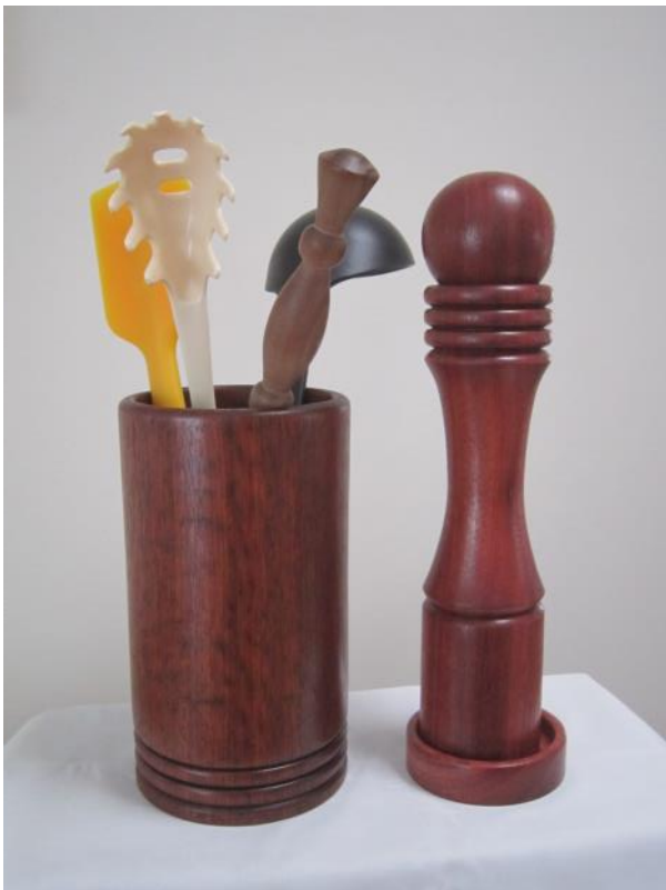
Left: kitchen tidy and pepper mill, both of red gum from a recovered veranda post