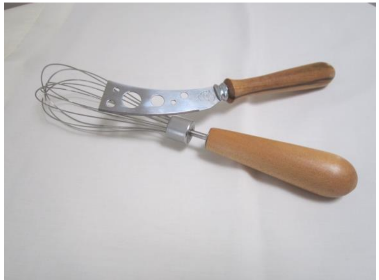
Above: whisk with NZ Kauri handle, and cheese knife with black-heart sassafras handle