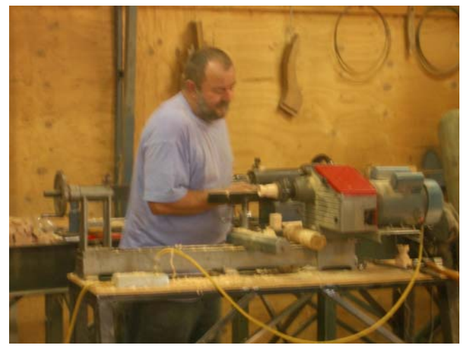
lan turning up egg cups at a fast pace.