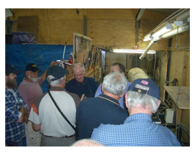
A view of the crowd sharing a joke