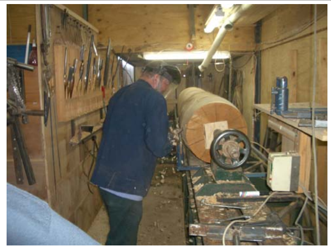
A view from the tail stock end of the 8ft log