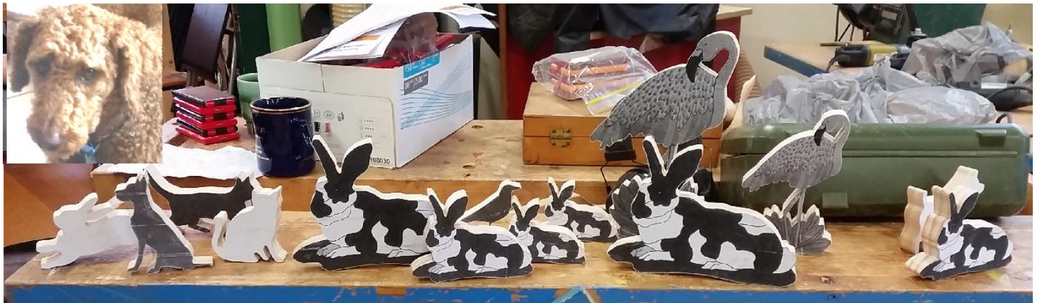
Bottom photo numerous animals scroll sawn by Klaus Koch